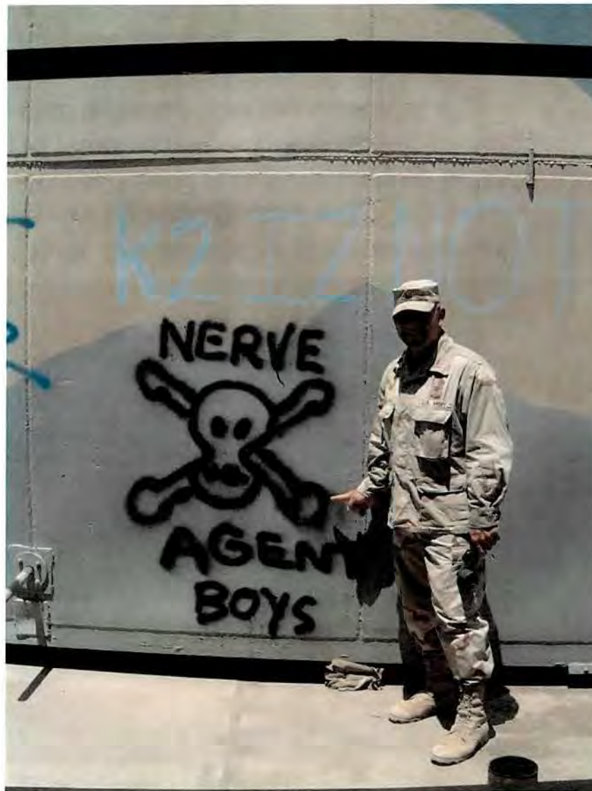
Figure B-2. (U) (S//NF) HAS 14 Markings – 5 B-2 July 02

These photos illustrate the risk communication challenge faced by the command at Stronghold Freedom to explain the false positive readings for Chemical Weapons in these structures.