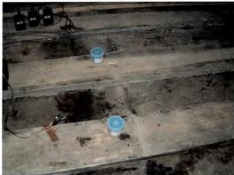
Figure B-6. (U) (S//NF)-HAS 17. Location of soil samples and cracks in concrete pad where soil was collected for samples 17-S-1 and 17-S-2. Photo also shows collocated air sampling pumps (locations 17A and 17B) placed at this location to capture air contaminants from this source. Soil was cleaned out of cracks to fill the two sample containers.