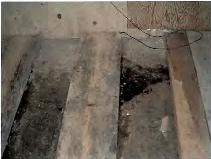
Figure B-5. (U) (S//NF)-HAS 17. Petroleum stain on concrete pad in rear of TOC. This is area where original sampling was performed in early June 2002 and false CW positives were generated by TEU. CHPPM-EUR also collected a Tenax air sample from the breathing zone in this general area; detected low levels of fuel related compounds. Dark “stain” in middle right is substance similar to driveway crack sealant (tar compound).

(U) (S//NF)-Field Final Report, Environmental Assessment – Hardened Aircraft Shelters, Stronghold Freedom, Karshi-Khanabad Airfield, Uzbekistan, 6 June – 20 July 2002