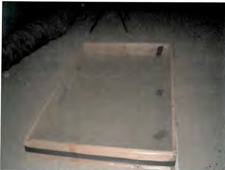
Figure B-3. (U) (S//NF) Typical TEU box used to “trap chemical vapors” from the concrete pad in the floor headspace in HAS 14. These were in shaded hangars and concrete pad temperature was cool to the touch. Presumptive blister agent detects were possibly a relic from treated wood (chromated copper arsenate) that might have been used in the construction of this box.

(U) (S//NF) Field Final Report, Environmental Assessment – Hardened Aircraft Shelters, Stronghold Freedom, Karshi-Khanabad Airfield, Uzbekistan, 6 June – 20 July 2002