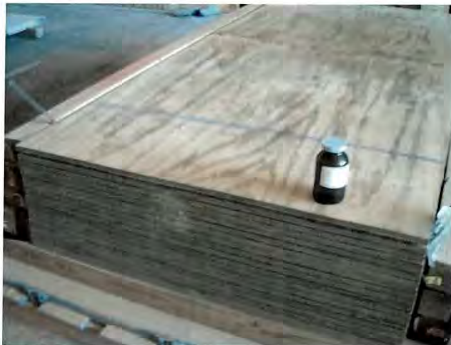
Figure B-4. (U) (S//NF) Osmose pressure treated plywood (treated with Chromated Copper Arsenate) that was sampled in HAS 15. Bulk samples of plywood and sawdust were collected from this source. A wipe was also collected from this stack of plywood (on side).